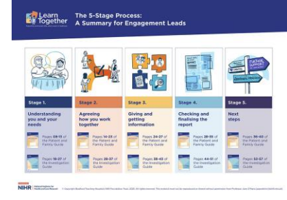
The Five-Stage Process summary

In order to obtain approval, each of the five stages of the 'Five-Stage Process' must be clearly represented (ideally, in both visual and written form). This is because it is important to retain the foundational aspects of the Learn Together approach as the resources are informed by extensive and independent research, using evidence to co-design a workable process that: